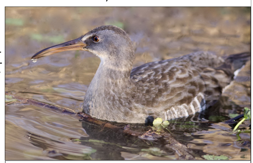
Clapper Rail swimming in HMP central wetland photographed by Ed Eder in late fall 2020.

Some political leaders and decision-makers may use the pandemic as an opportunity to push through policy changes with a reduced public consultation process due to the "emergency situation." Just because we have a public health emergency, this should not translate to a "free pass" to overlook the en-