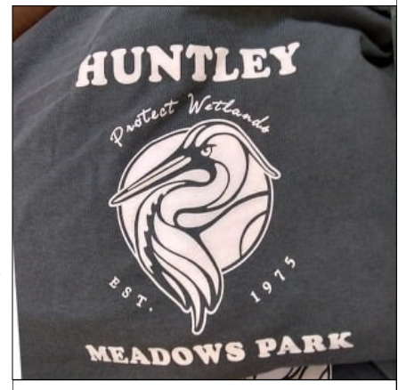
Logo on short- and longsleeved shirts.

You can check our Facebook page <a href="https://www.facebook.com/friendsofhuntleymead-owspark">www.facebook.com/friendsofhuntleymead-owspark</a> for the next pop-up event date. See you in spring.